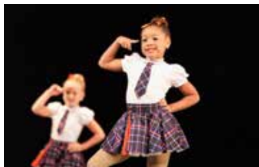
Dance schools like SheeKriStyle Academy of Dance Arts