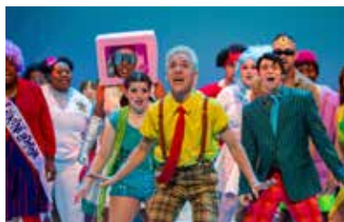
Fort Wayne Civic Theatre