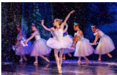
Fort Wayne Ballet