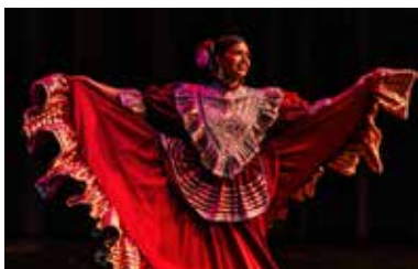
Cultural programming like Amaneceres de Mexico