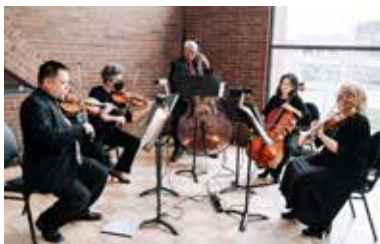
Fort Wayne Philharmonic