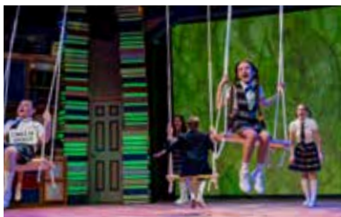
Fort Wayne Youtheatre