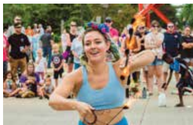
Taste of the Arts Festival